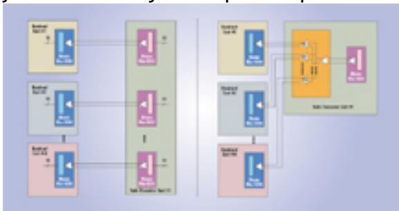
Figure 3a. A broadcast topology is here implemented via the brute force method of using ten LVDS serializer ICs. Figure 3b. The MAX9150 multiport repeater frees up board space by eliminating the serializer ICs.

process received data from a single radio transceiver card. The brute force implementation of this architecture would require the radio card to include as many serializers as there are deserializers on the destination baseband cards (Figure 3a). By using a multiport repeater such as the MAX9150, this serializer count can be dramatically reduced by as much as 10:1 (Figure 3b). When used with a single serializer, the MAX9150 replaces 10 serializers with only one. This architecture is effective only with multiport repeaters specified with sufficiently low jitter. Jitter, the deviation from the ideal timing of an event or signal edge, prevents the deserializer from successfully recovering clock and data from a serial bit stream. The jitter budget for a typical LVDS serializer/deserializer pair can be as low as several hundred picoseconds. This budget is further reduced by jitter resulting from traces, cables, and connectors in the signal path. Therefore additional devices in the signal path between a serializer and deserializer must exhibit extremely low jitter. With only 120ps maximum peak-to-peak maximum jitter, the MAX9150 guarantees lower jitter than any multiport repeater on the market.