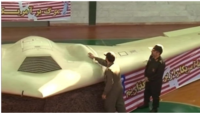
Figure 1. The RQ-170 Sentinel drone purportedly downed by Iran in December

For those of us working in the RF communication test industry, stories like this keep us awake at night. Our minds race with questions: How were these communication links tested? Could this have been prevented with more thorough testing? How can we keep this from happening again? Regardless of how a state-of-the-art American UAV ended up in Iranian hands, this situation highlights the vital need for engineers to design and test RF communication equipment under the absolute worst case mission conditions.