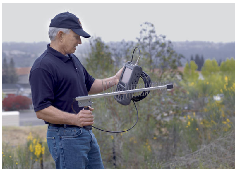
Figure 1. Agilent's handheld FieldFox microwave spectrum analyzers offer precise measurements up to 26.5 GHz and can withstand your toughest working conditions.

When a wireless system does not operate as expected and radio interference is suspected, a modern, high-performance spectrum analyzer should be used to confirm the existence of undesired signals in the frequency channel of operation. Such tools are extremely useful for measuring the power levels of interfering signals as a function of time, frequency and location. Since interference testing often requires measurement and data collection in the environment surrounding a wireless system, a lightweight, battery-operated instrument with performance consistent with traditional bench-top instrumentation is highly recommended (Figure 1).