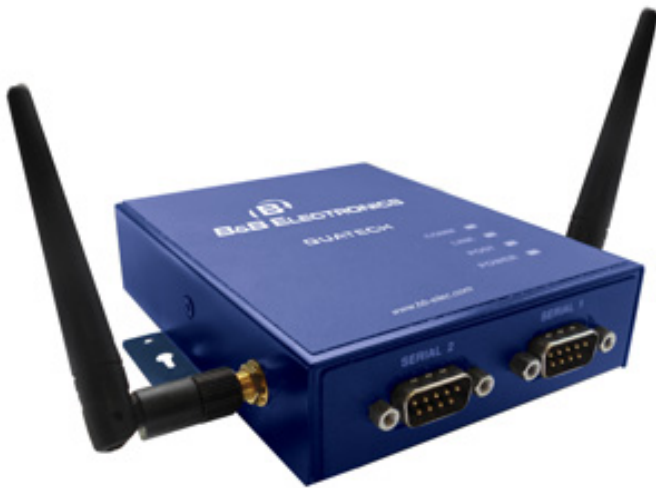
Figure 2. Legacy serial devices are being Ethernet-enabled with Wi-Fi connections using both embeddable and external Wi-Fi Access Points

( http://www.engin.umich.edu/newscenter/feature/smallsensor/ [1])