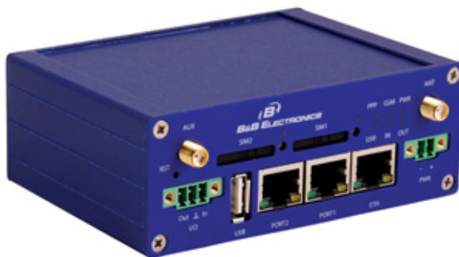
Figure 3. Cellular routers can establish network nodes anywhere there's cellular telephone coverage.

Like Flame, with its human data mules, thinking networks will use multiple techniques to transmit and deliver information. Single vendor solutions and proprietary data communications protocols have already become a thing of the past. Users are demanding network-wide interoperability and the ability to make use of any data communications option that may be available. Legacy serial devices are being Ethernet-enabled with Wi-Fi connections using both embeddable and external Wi-Fi Access Points. (See Fig. 2) Where a fiber optic buildout would be impractical, designers are deploying cellular routers (See Fig 3) that can establish network nodes anywhere there's cellular telephone coverage. Thinking networks will continue the trend, using various combinations of copper cable, fiber optics,